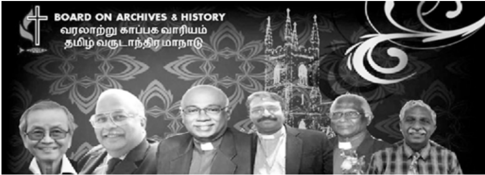
தமிழ் வருடாந்திர மாநாடு வரலாறு கருத்துக்களம் 2017

T oday in History, Saturday 8th April 2017, the Tamil Annual Conference Board on Archive and History (BOAH) with the help of Board of Laity organized the first TAC History Forum 2017 at Emmanuel Christian Assembly, Taiping with the theme, 'Looking back to look forward'. A total of 210 people from the Northern and Perak Districts, including the speakers, attended the forum. TMC Sg. Petani sent 40 participants and that was the largest number sent by a local church. A short quiz was made available to gauge how much the participants know about our history.