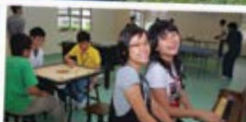
Wholesome Campus Life