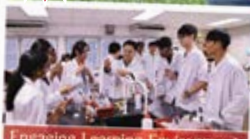
Engaging Learning Environment