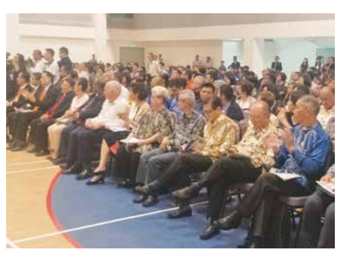
The VIPs attending the official opening