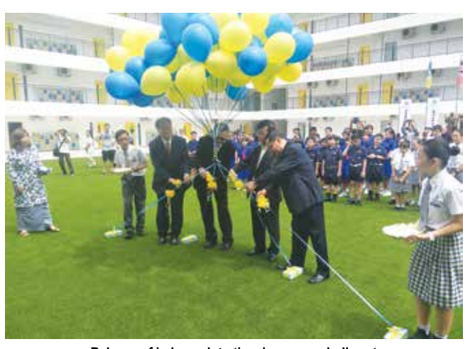
Release of baloons into the air as a symbolic act to announce the official opening of WMS Penang (Intl)