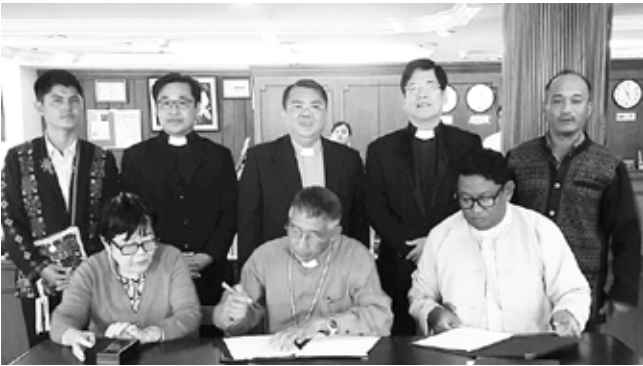
2018年2月6日，吾会和南板宣教区的代表们，见证下缅甸卫理公会的Bishop Lu Aye（中坐者）签署文件。