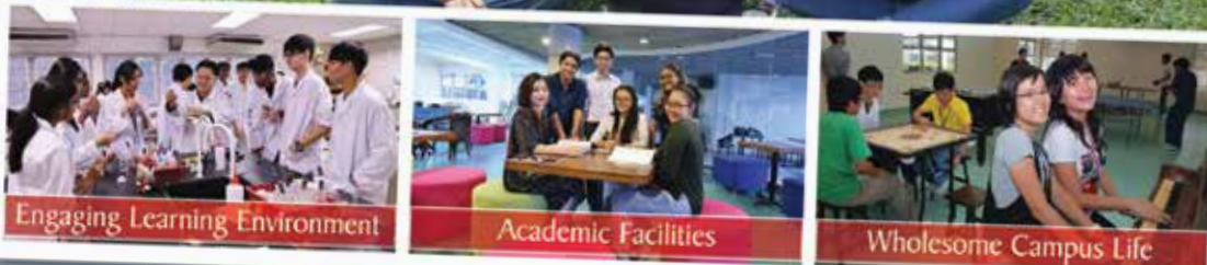
Engaging Learning Environment