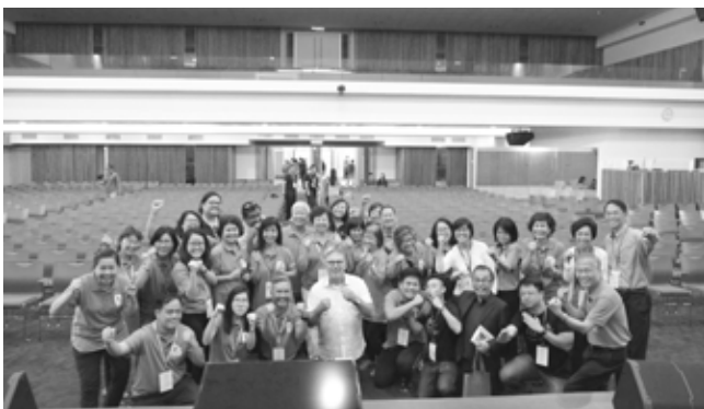
Volunteers of Trinity Methodist Church PJ, Organizing committee members with speakers

youth and young adult attendance in Methodist churches. We must wake up to realise discipleship begins at home. We