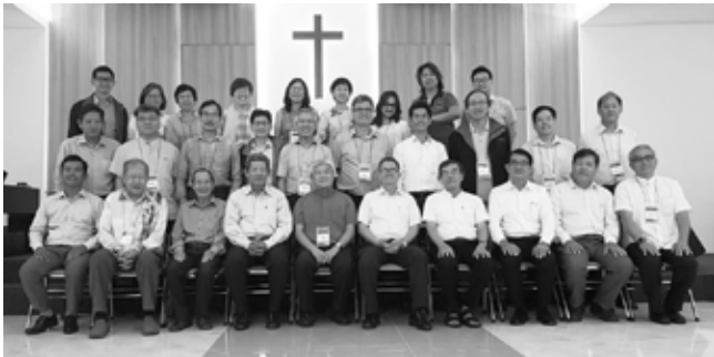
Attendees at the Second Asian Methodist Mission Platform, 2019