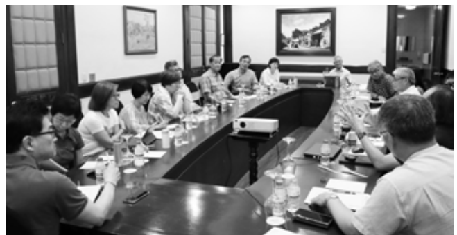
Final session of 2 nd AMMP

All Nations Theological Seminary established by the Korean Methodist Church in Siliguri, India. A local TRAC church will potentially be using the school as a location for training of leaders from nations bordering Siliguri.