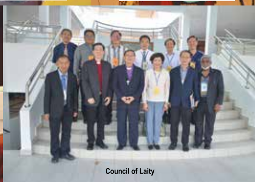
Council of Laity