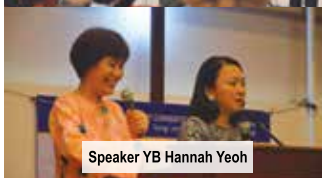
Speaker YB Hannah Yeoh