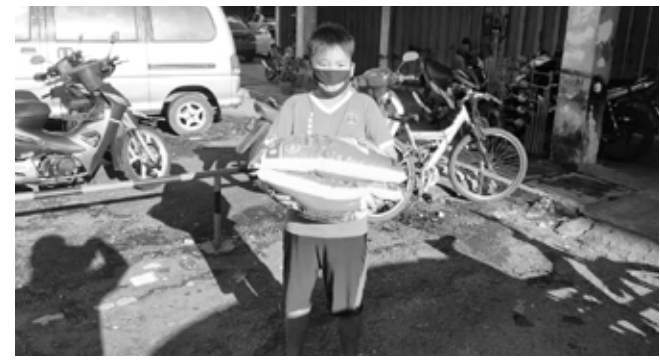
3月26日,缅甸难民学校(HAN International School)饥肠辘辘的学生收到粮食后,喜上眉梢。

有间在孤儿院寄宿的八十多个缅甸难民学生被迫回家,家里断炊了,他们向学校求助……要顾及这些散居在各地域贫民租屋区的难民家庭不易,要有人一一联络、安排、分配、载送和分派粮食才行!MCRD团队花了四天才送完。有些难民家庭已挨饿两天了,孩子们看到食物送来眼前,都雀跃万分!MCRD的资助有如及时雨,让寄居者得以维生。若跨州行动,也要有人愿意借出大卡车才行。