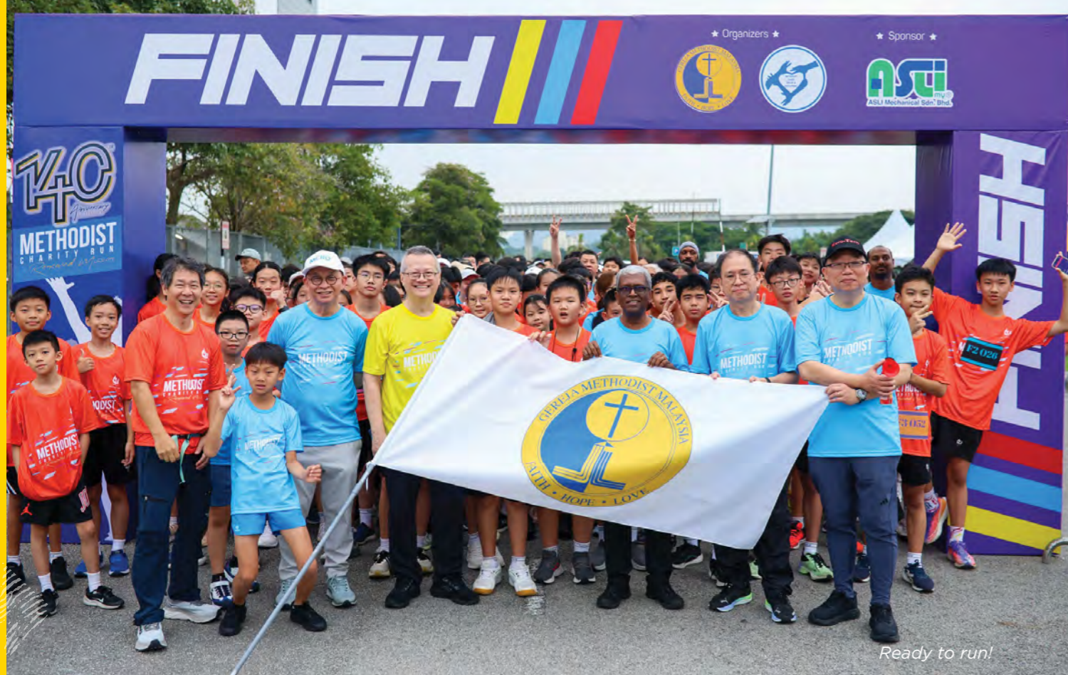
Ready to run!