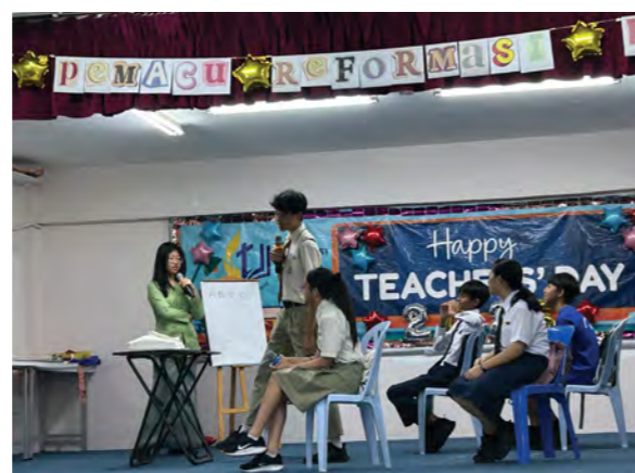
Bringing creativity - Our secondary school students captivate the audience with a lively, student-led performance in celebration of Teachers' Day. A tribute to the educators who inspire the students daily