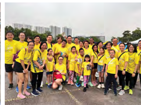
Sunday School team ready to go