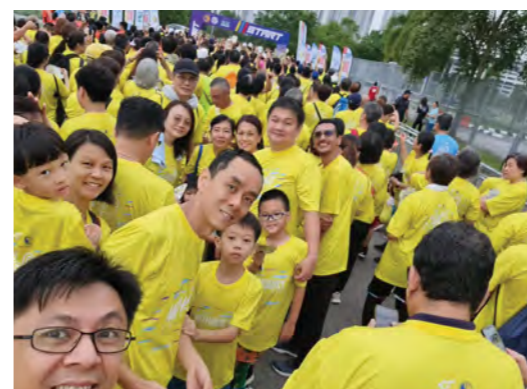
Starting line for 2km walkers!

We praise and thank God for the many wonderful people in our journey. Truly, only God deserves all the honour and glory.