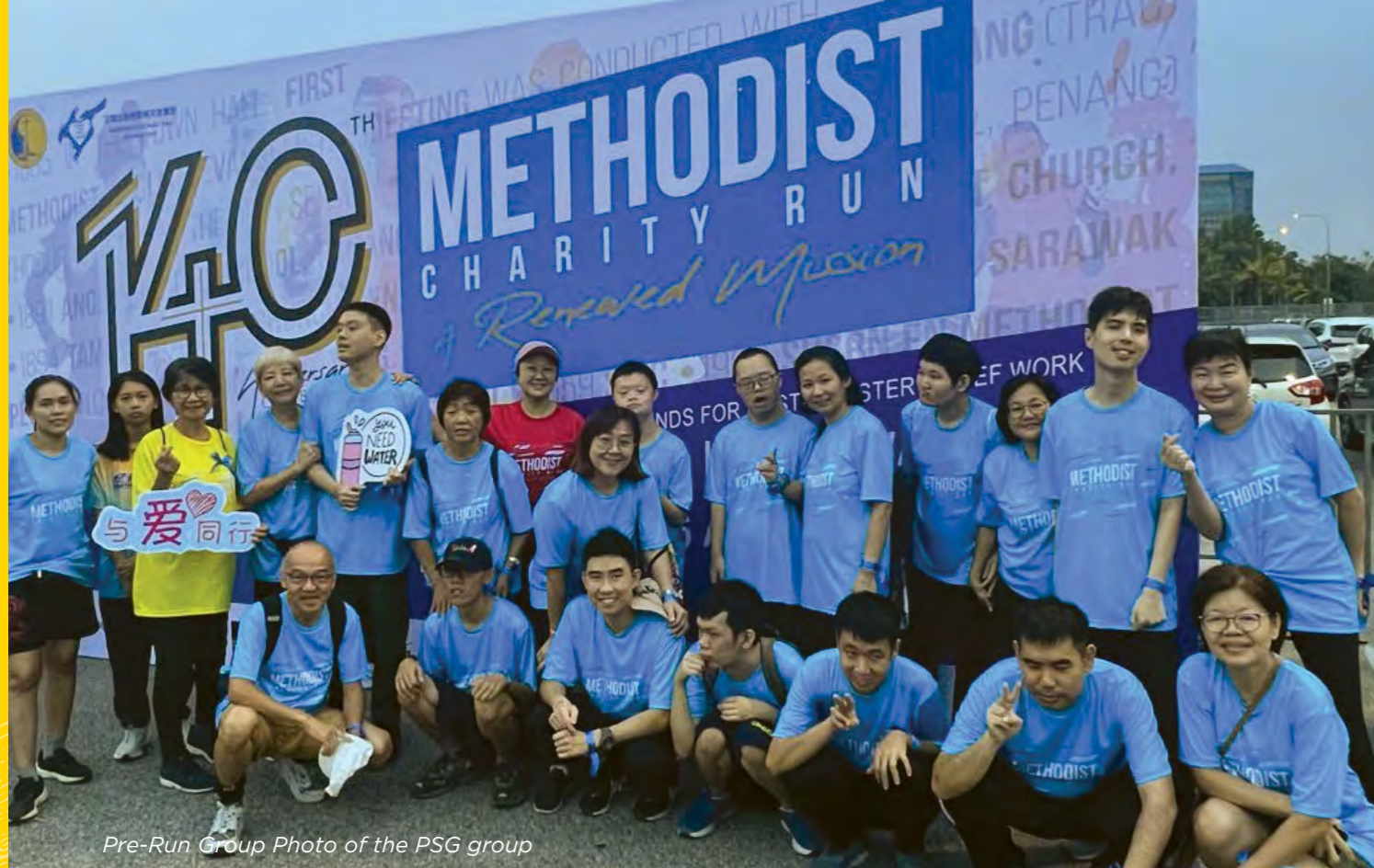
Pre-Run Group Photo of the PSG group