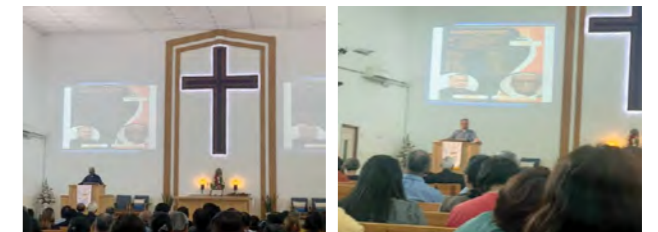
Sermon delivery by Bishop and President