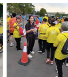
Thank you volunteers!