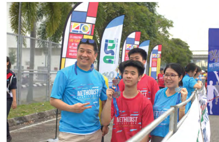
Run completed, Mission continues