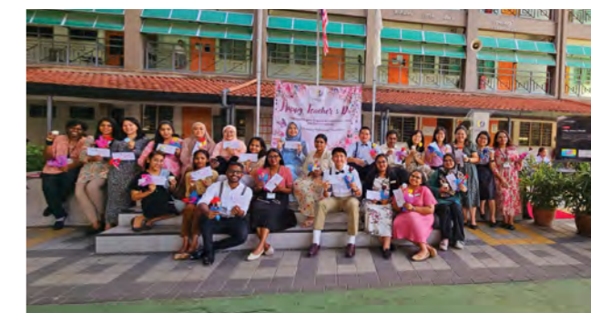
Our amazing teachers with happy faces

To find out more about WMS, please visit us at wms-school.edu.my , or simply scan the below QR code: