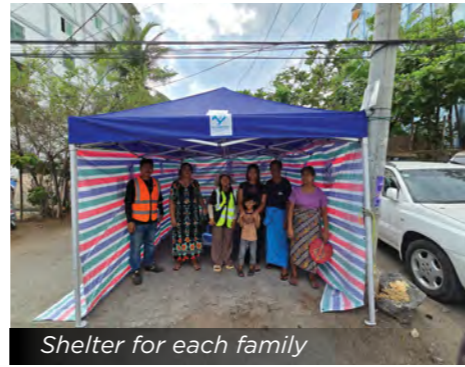
Shelter for each family