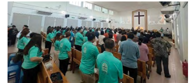
Atmosphere of prayer and worship