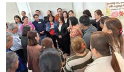
Prayer and Commissioning Session