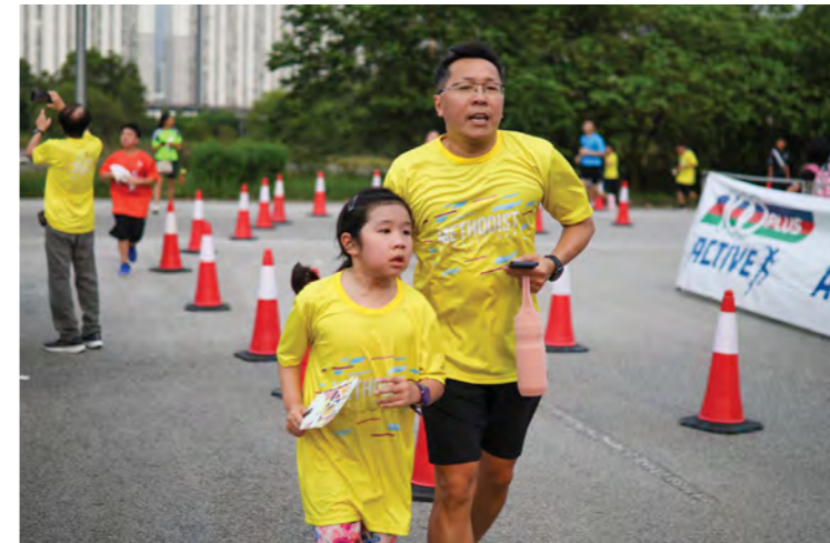
A father and daughter, running side by side, sharing the joy of the journey

Though the run has ended, the mission continues. The finish line marked not a conclusion, but a new beginning. Tracks may end, but love keeps moving. Our steps may pause, but our calling endures. This generation run not just for today, but to light the way for the next. We are not just covering 2km, 5km or 10km — we are running the course that leads to eternity.