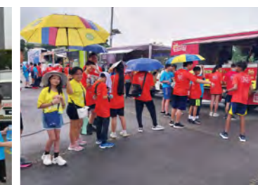
Food carnival after the run!