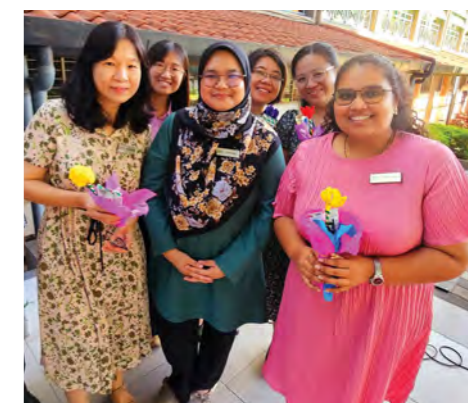
Moment captured: Smiles with tokens of appreciation

To our teachers at WMS and across all Methodist educational institutions, THANK YOU. You are the heart of our mission, and we praise God for your lives and leadership.