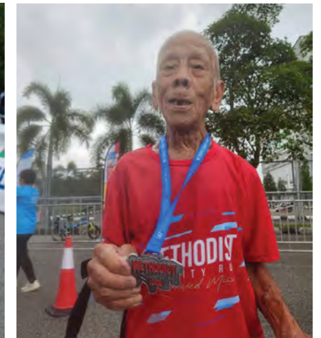
At 93, he’s still on the run—faith never rests!