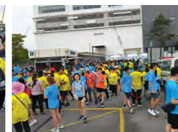
Crowded 100plus store