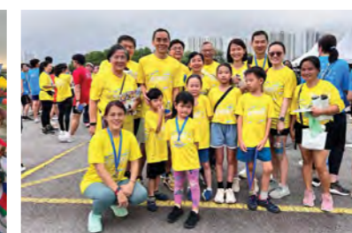
Proudly showing off their medals