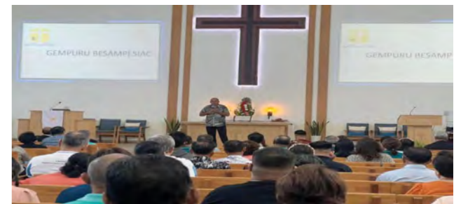
Testimony and Healing Session