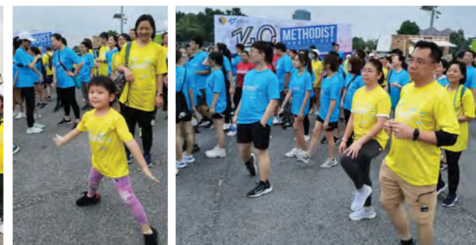
Warm up exercise