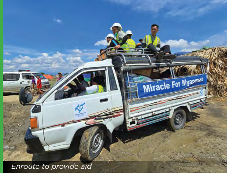
Enroute to provide aid