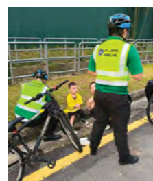
Thank you first aiders!