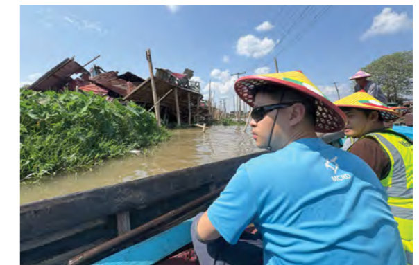
Travelling by boat to hard to reach places

What has been the most rewarding to me from these missions is that, despite different languages, cultural backgrounds, we all share the same language of love for God and His people. I pray that God will enable us to do more for this country—and that, one day, peace and prosperity will rest upon this land.