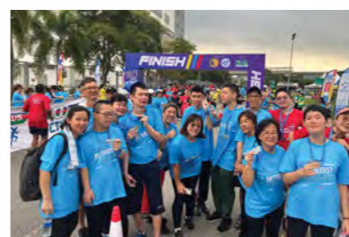
PSG group at the Finish Line