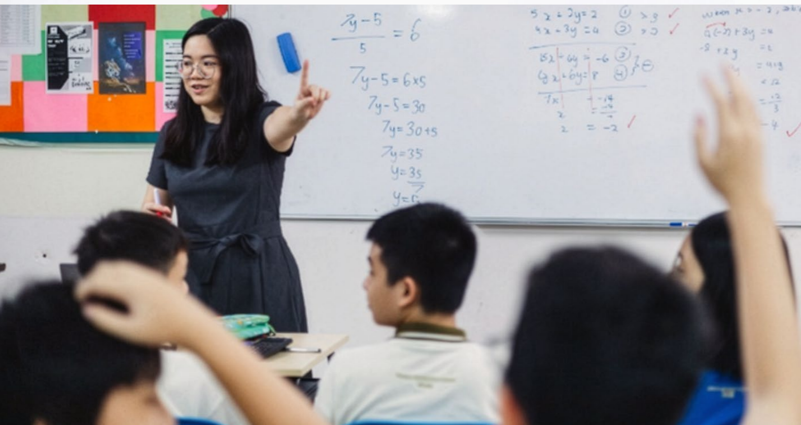
One of our educators in action