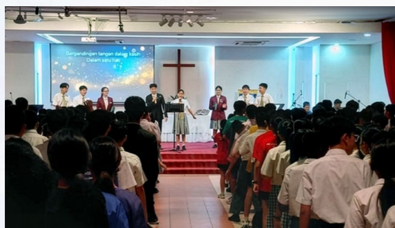
Students leading worship on stage

On 15 January, the community of Wesley Methodist School Kuala Lumpur (Private) gathered in gratitude to dedicate the 2026 academic year to God under the theme “Respect for Life.” The occasion also marked the dedication of enhanced school facilities, a meaningful step forward as the school continues its Methodist education mission grounded in faith, excellence, love, and respect.