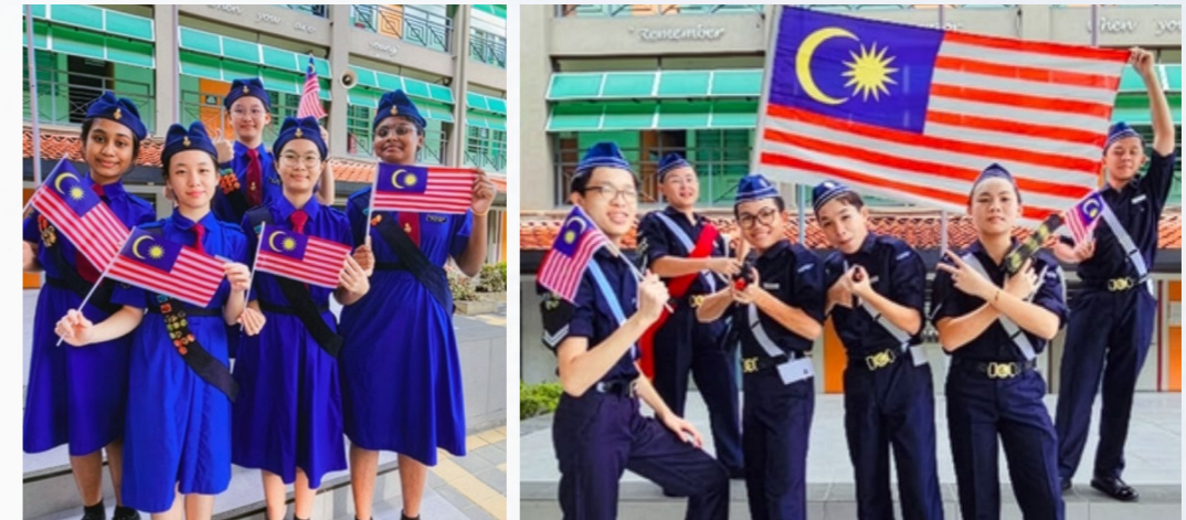
Girls' & Boys' Brigades: celebrating Malaysia's National Day

This ongoing mission reflects John Wesley's belief that education should transform individuals who, in turn, transform society for Christ.