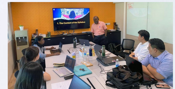
Spiritual Formation training conducted by the Central Chaplain