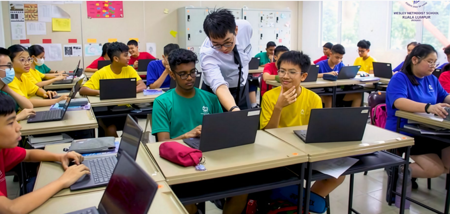
Teaching and learning in action

For generations, Methodist education has been a faithful expression of the Church's mission, ie. nurturing young people not only academically, but spiritually, morally, and socially. Rooted in the Wesleyan tradition, education is seen as a ministry: forming individuals who love God, serve others, and live purposefully.