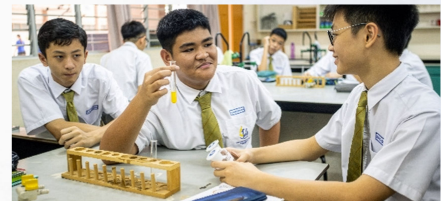
Students engaged in learning and discussion in a science laboratory setting

Discover how Methodist education continues to nurture lives, inspire purpose, and prepare future generations for faithful service. Visit www.wms-school.edu.my to learn more about Methodist education at Wesley Methodist schools (WMS).