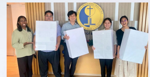
The latest batch of SPOT trainees (SPOT 3.0) with their trainer

As such, the SPOT Programme exists to prepare such educators for service in any of our Wesley Methodist Schools.