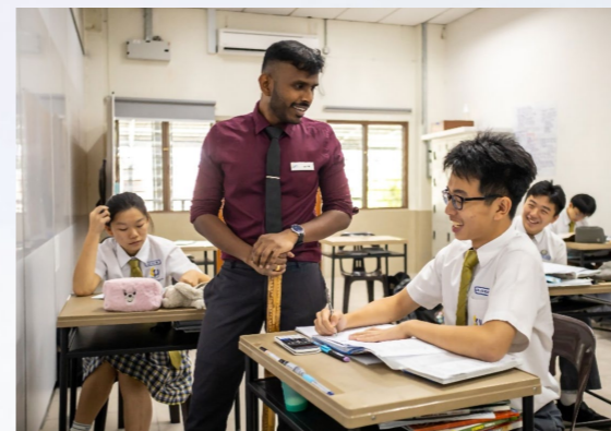
Happy teaching and learning environment