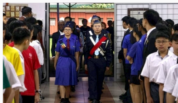
Girls’ and Boys’ Brigade members marching in

The service beautifully reflected student leadership in action, from the crisp discipline of the Boys’ and Girls’ Brigades Guard of Honour to a time of worship led by students. When given opportunities to serve, our students truly shine, reminding us that education is not only about knowledge but about character, faith, and purpose.