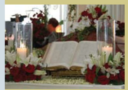
Professional Arrangements 专业策划

One of Malaysia's most beautiful memorial park, Nilai Memorial Park is situated just 30 minutes away from Kuala Lumpur. Surrounded by lush natural greenery, the Park successfully combines the best of oriental traditions and architecture with western planning and design. Set amidst all this is a series of tastefully designed and crafted memorials and niche columbariums, which not only provide a serene final resting place for our departed loved ones but also for others to pay their respects.