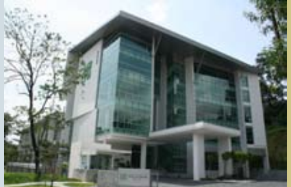
Xiao En Centre, Jalan Kuari, Cheras 孝恩館,吉隆坡蕉赖

There is peace of mind in being able to fulfill your final act of filial piety and assurance knowing that every detail will be taken care of conscientiously. There is dignity in a meaningful ritual well planned and well performed. A Xiao En Bereavement Care Package ensures that the warm memories of your departed loved one will endure for generations to come.