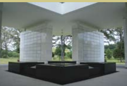
Open-Air Columbarium 开放式骨灰阁