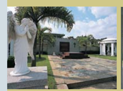
Special Design Burial Plot 特別设计墓地