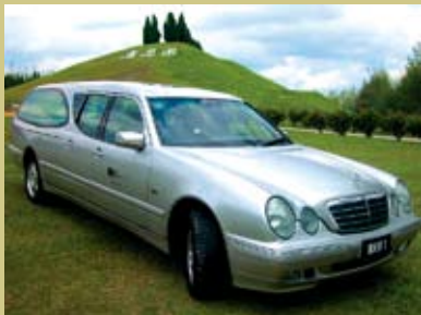
Imported Luxury Hearse 进口豪华灵车