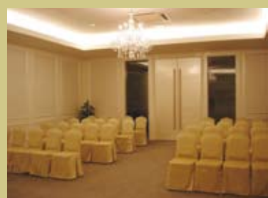
Multi Function Halls 多元用途礼堂