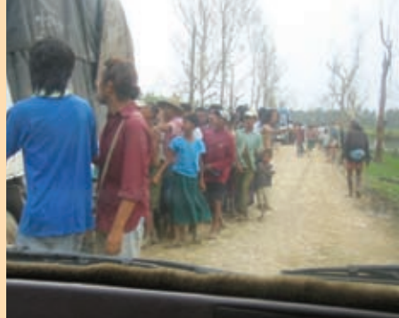
Survivors line the road waiting for relief.