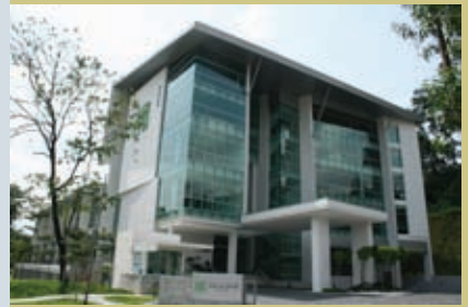
Xiao En Centre, Jalan Kuari, Cheras 孝恩館,吉隆坡蕉赖

There is peace of mind in being able to fulfill your final act of filial piety and assurance knowing that every detail will be taken care of conscientiously. There is dignity in a meaningful ritual well planned and well performed. A Xiao En Bereavement Care Package ensures that the warm memories of your departed loved one will endure for generations to come.