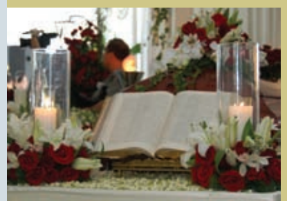
Professional Arrangements 专业策划

One of Malaysia's most beautiful memorial park, Nilai Memorial Park is situated just 30 minutes away from Kuala Lumpur. Surrounded by lush natural greenery, the Park successfully combines the best of oriental traditions and architecture with western planning and design. Set amidst all this is a series of tastefully designed and crafted memorials and niche columbariums, which not only provide a serene final resting place for our departed loved ones but also for others to pay their respects.