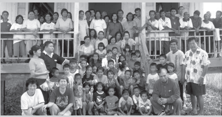
After service at the church in Rumah Tutus.