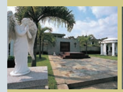
Special Design Burial Plot 特别设计墓地