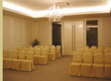
Multi Function Halls 多元用途礼堂