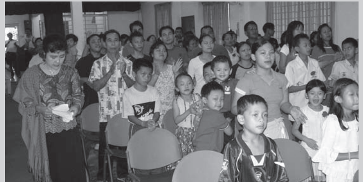
BM worship service at Trinity Methodist Church, Kuching.