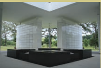
Open-Air Columbarium 开放式骨灰阁