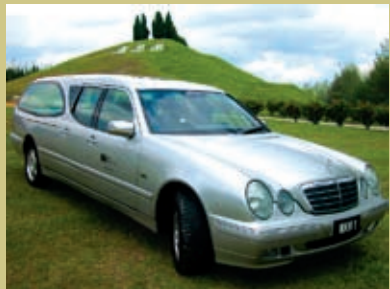
Imported Luxury Hearse 进口豪华灵车