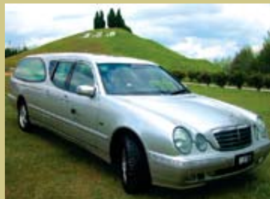
Imported Luxury Hearse 进口豪华灵车