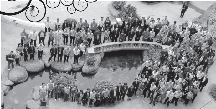
Gathered around the swimming pool.

Ministers and lay delegates from our TRAC churches came together for the 34 th Session TRAC Annual Conference held at the Everly Resort Hotel, Melaka. That Session was significant for it marked the last of the “quadrennial working year” and the beginning of another with a new theme, “Spreading Scriptural Holiness, Transforming the Nation.” Its accompanying four essentials are: