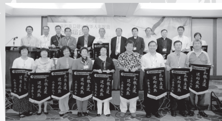
Everyone was delighted when awarded the 10% Growth Banner