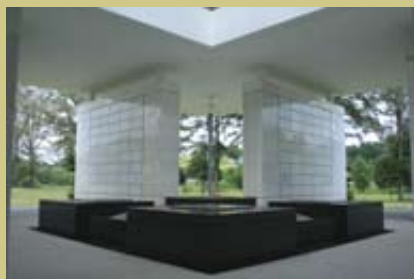
Open-Air Columbarium 开放式骨灰阁