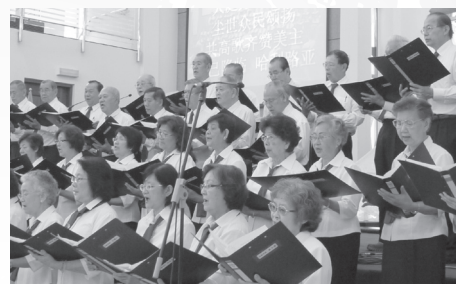
MSF Choir of Methodist Hokkien Church KL presenting a song during the Holy Communion.