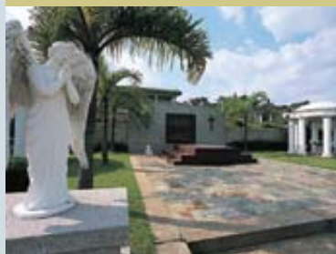
Special Design Burial Plot 特别设计墓地