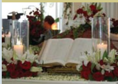
Professional Arrangements 专业策划

One of Malaysia's most beautiful memorial park, Nilai Memorial Park is situated just 30 minutes away from Kuala Lumpur. Surrounded by lush natural greenery, the Park successfully combines the best of oriental traditions and architecture with western planning and design. Set amidst all this is a series of tastefully designed and crafted memorials and niche columbariums, which not only provide a serene final resting place for our departed loved ones but also for others to pay their respects.