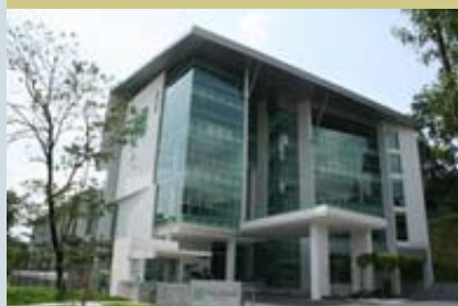
Xiao En Centre, Jalan Kuari, Cheras 孝恩館，吉隆坡蕉賴

There is peace of mind in being able to fulfill your final act of filial piety and assurance knowing that every detail will be taken care of conscientiously. There is dignity in a meaningful ritual well planned and well performed. A Xiao En Bereavement Care Package ensures that the warm memories of your departed loved one will endure for generations to come.