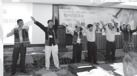
Pastors from northern Thailand presented a song in the Aka language

There were six pastors from northern Thailand who came to observe the Conference Session. It was the 25th Anniversary of CMC Kepong. The Ordination and Closing Service was held after the end of business.