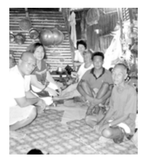
Helping who is living in poor condition.

Care ministry's purpose is to assist and help poor families around Kuching, Bau, Serian and Lundu through frequent visitation (by staff, volunteers and care groups), providing food aid & basic necessities, helping in house repairs and also building houses for the hard core poor (if necessary). Our care ministry also channel individuals, churches, care groups and even companies to help and foster some of the poor families that we are assisting. We