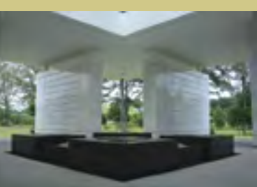
Open-Air Columbarium 开放式骨灰阁