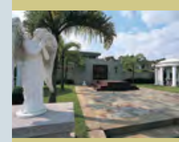
Special Design Burial Plot 特别设计墓地

Lastly, we see the lesson of friendship. It is rare to see a friendship between a Royal and a commoner that is so close and loving. Yet, what mattered most in their friendship is that in the midst of all the differences, they learned to respect, love and trust each other. It also showed that friends stick with each other, admit mistakes and do whatever is necessary to see the other succeed in life.