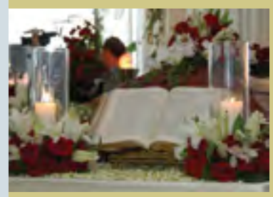
Professional Arrangements 专业策划

One of Malaysia's most beautiful memorial park, Nilai Memorial Park is situated just 30 minutes away from Kuala Lumpur. Surrounded by Jush natural greenery, the Park successfully combines the best of oriental traditions and architecture with western planning and design. Set amidst all this is a series of tastefully designed and crafted memorials and niche columbariums, which not only provide a serene final resting place for our departed loved ones but also for others to pay their respects.