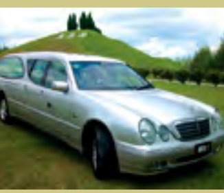
Imported Luxury Hearse 讲口豪华灵车