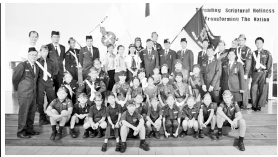
4th Miri Group Photo 2014 Enrolment Sunday

"Today as we learn about the principle of spiritual victory, we need to understand that all of us are in spiritual battle and no one can be exempted. And if we want to win the battle, we need to remember who is in charge," said the pastor-in-charge and Chaplain of the 4th Miri GB.