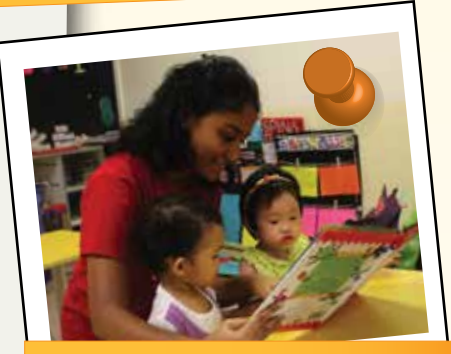
Teachers who love teaching, teach children to love learning" - Anon.