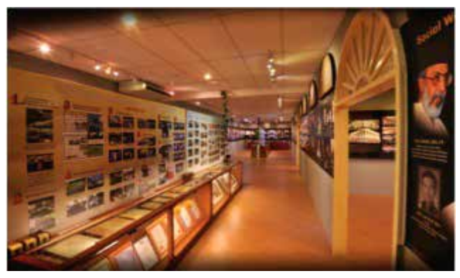
MBS Hall of Fame

Also on display are old school magazines, report cards, enrolment records, the School's trophies and achievements, school publications and books authored by our alumni. Some of these items date back to as early as 1934! Special events in the School are documented for posterity.