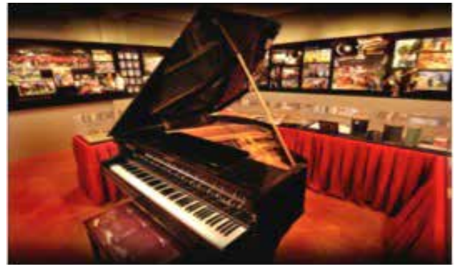
A 1930s Baby Grand Piano Used During the Pre Merdeka School Assemblies

This room takes a closer look at growing up in MBS in the new millennium and MBS' media coverage telling of stories of courage, achievement and generosity as well as charting the story of Pykett