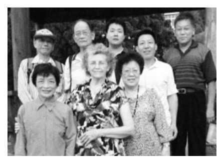
Taken before parting company on top of Mt Kuliang. Whither shall they meet again ???

Time, where did it go? What did it do? Well, it takes time to join all the dots and the broken lines in life. By the grace of God and his unending faithfulness, all the dots and broken lines will eventually be joined altogether and make perfect sense.... IN HIS TIME!