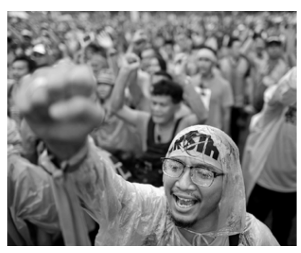
At a time of political uncertainty, with Malaysians taking part in a mass rally urging the prime minister to step down, the federal and state governments should stay true to the spirit of the Federal Constitution. – The Malaysian Insider pic by Najjua Zulkefli, August 30, 2015.

"Any form of disrespect shown to the constitution and misreading or misapplication of its original spirit will only exacerbate the present disturbing situation that will not do justice to the theme 'One Heart and One Spirit'," said MCCBCHST in a statement.