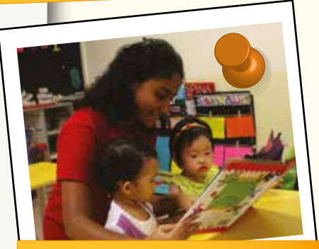
Teachers who love teaching, teach children to love learning" - Anon.