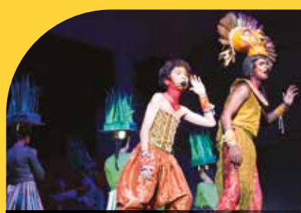
The Breathtaking Musical, The Lion King