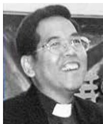
Chinese Annual Conference President

The Methodist Church in Malaysia has Six Annual Conferences and one Mission Conference. In this issue of Pelita, we would like to introduce these Presidents and Superintendent. The Presidents have also included their New Year greetings and thoughts for the coming year.