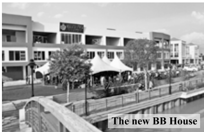
The new BB House

Three hundred Officers, Helpers, Boys and Girls from the 34 Coys throughout Sarawak were present to witness the opening and dedication ceremony of the new Sarawak BB HQ building nestled in the serene suburbs of Sibiu.