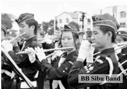
BB Sibiu Band