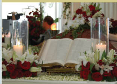
Professional Arrangements 专业策划

One of Malaysia's most beautiful memorial park, Nilai Memorial Park is situated just 30 minutes away from Kuala Lumpur. Surrounded by lush natural greenery, the Park successfully combines the best of oriental traditions and architecture with western planning and design. Set amidst all this is a series of tastefully designed and crafted memorials and niche columbariums, which not only provide a serene final resting place for our departed loved ones but also for others to pay their respects.