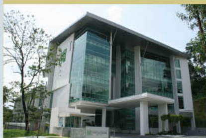
Xiao En Centre, Jalan Kuari, Cheras 孝恩館，吉隆坡蕉赖

There is peace of mind in being able to fulfill your final act of filial piety and assurance knowing that every detail will be taken care of conscientiously. There is dignity in a meaningful ritual well planned and well performed. A Xiao En Bereavement Care Package ensures that the warm memories of your departed loved one will endure for generations to come.