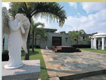
Special Design Burial Plot 特别设计墓地