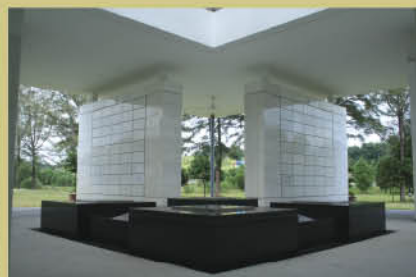
Open-Air Columbarium 开放式骨灰阁