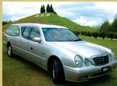
Imported Luxury Hearse 进口豪华灵车