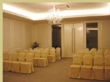
Multi Function Halls 多元用途礼堂