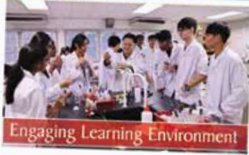
Engaging Learning Environment