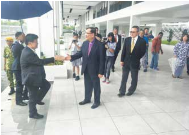
Bishop greeting the Chief Minister of Penang