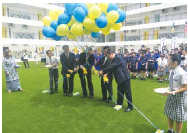
Release of balloons into the air as a symbolic act to announce the official opening of WMS Penang (Intl)