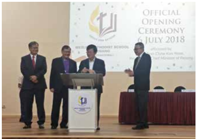
Signing of the plaque by Chief Minister of Penang