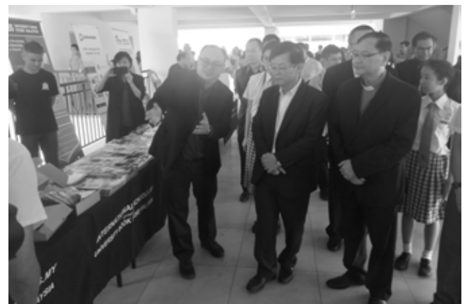
Chief Minister of Penang visiting the exhibition booths