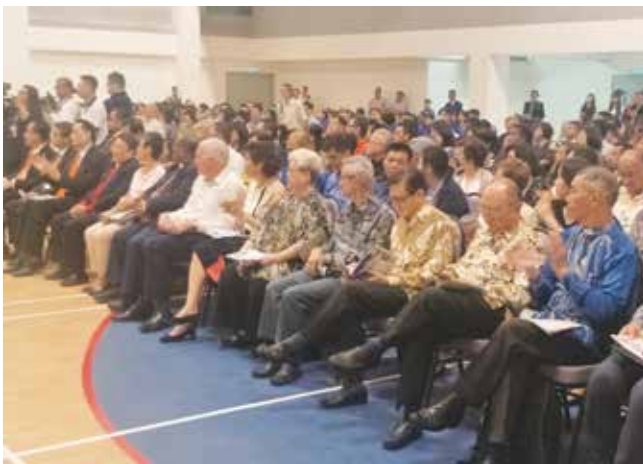
The VIPs attending the official opening