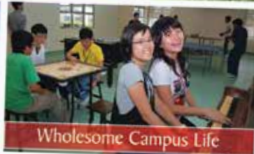
Wholesome Campus Life