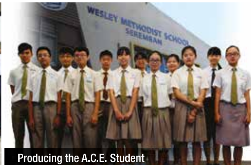
Producing the A.C.E. Student

Central to Wesley Methodist School's mission is a formula for educating the "whole person" by providing holistic education to prepare students for the real world and contribute to society and nation building.