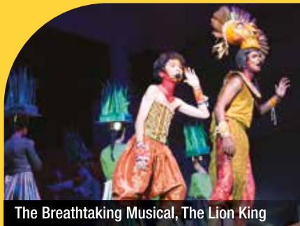
The Breathtaking Musical, The Lion King