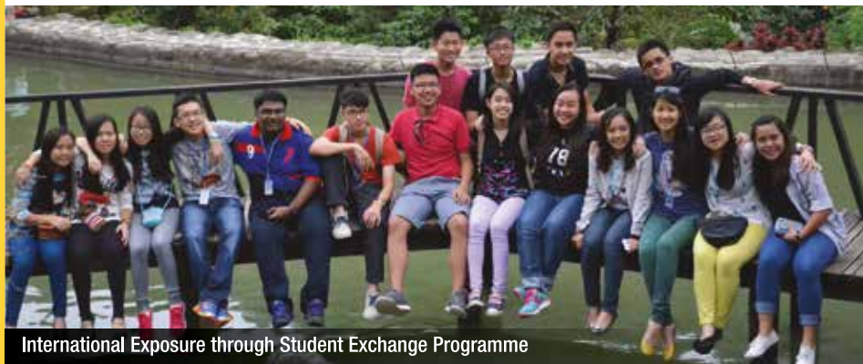
International Exposure through Student Exchange Programme