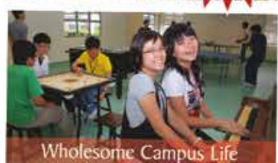
Wholesome Campus Life