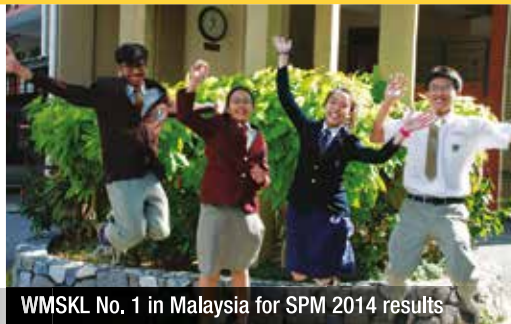
WMSKL No. 1 in Malaysia for SPM 2014 results