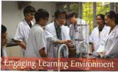
Engaging Learning Environment

Apply now with your SPM/O Level results*