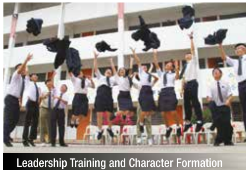
Leadership Training and Character Formation