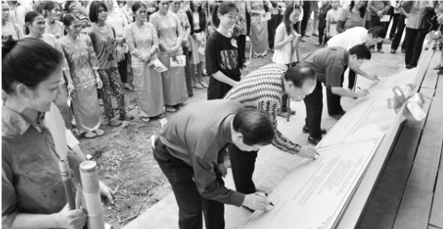
Signing on the inscribed board